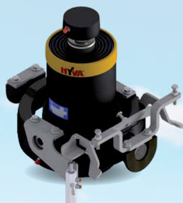
UH range for heavy duty trucks and (agri) trailers