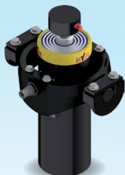
UL Range for light duty trailers and vans

Telescopic hydraulic cylinders – designed to match your application