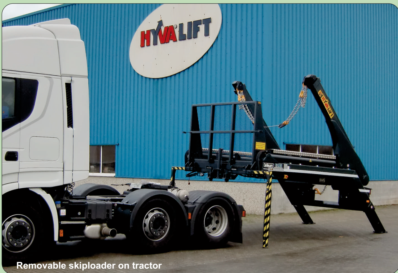
Removable skiploader on tractor